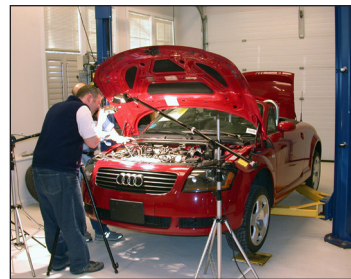
Bentley technical editors working on a TT Roadster.

Includes a 32 page color Audi TT Familiarization section