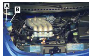
See how to perform routine maintenance procedures, such as checking fluids. 03 Maintenance